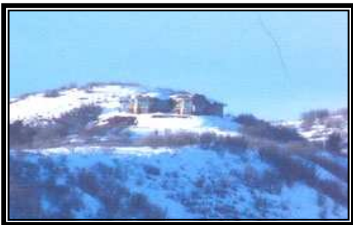
Not Skylined, on Skylined Ridge

After recent public meetings held to discuss future development in Routt County, it is clear that many County residents desire to preserve scenic view corridors. A key component in view corridor preservation is the visual impact of structures built on ridges, as seen from the County's most traveled roads. The County understands and respects an individual's private property rights, but also believes that the community's goals need to be achieved. These guidelines are provided as a reflection of the community's intent to preserve "skylined" ridges.